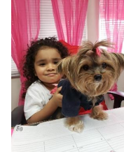
2021 Our partnership this year helped a small dog named Tuffy who was rushed to the Pacific and Santa Cruz Veterinary Specialist.